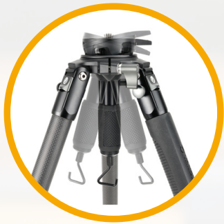
Levelling System ±15° tilt and 360° pan