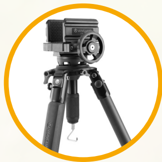
Rifle Clamp head option (GM)