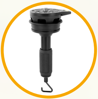
Handle Control and removable