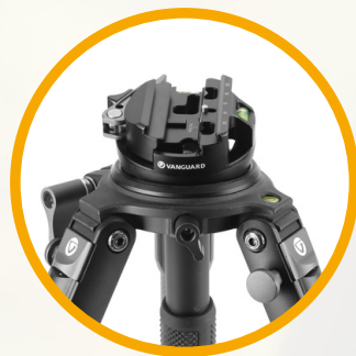
Arca/Picatinny head option (PR)